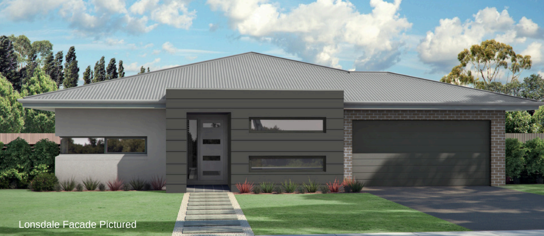
Lonsdale Facade Pictured