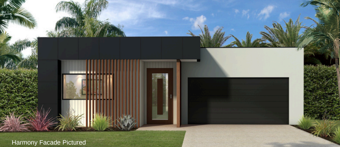
Harmony Facade Pictured